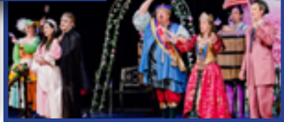
Cast / Rose of the Danube Capitol Opera Harrisburg